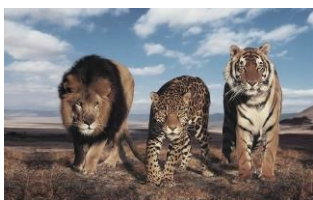
Big Cats Non-Chronological Report Writing